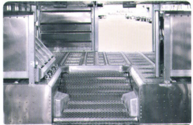
Lower rear partition gate has been widened to 55" to help reduce bruising. You can operate the ramp lid with the gate open or closed for increased driver safety.