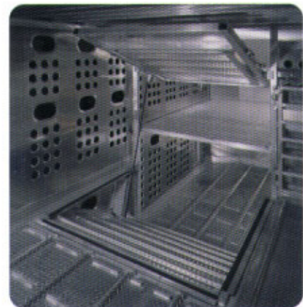
Front 60" wide counterbalance ramp makes loading and unloading quick and easy. Easily greased hinge pipes and nylon slide strips make it smooth to operate under any conditions.