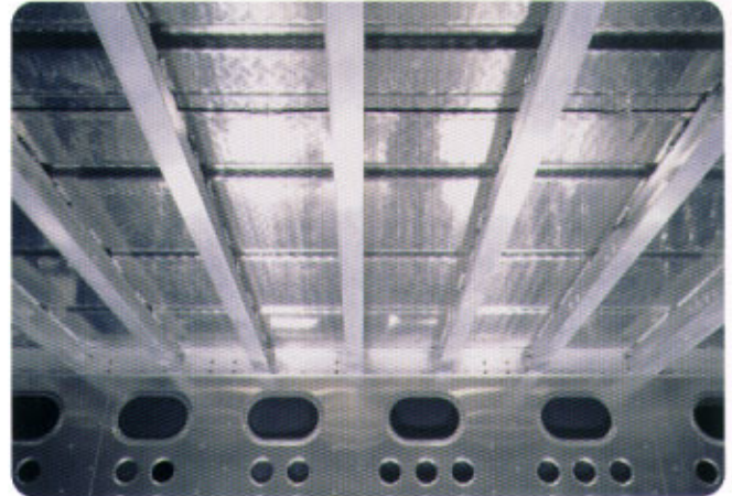
Welded 3" I beam cross members coupled with "Super High Grip" diamond plate floors with unsurpassed diamond height and edge sharpness and you have the long-life, leak-resistant floor that Merritt has always been known for.